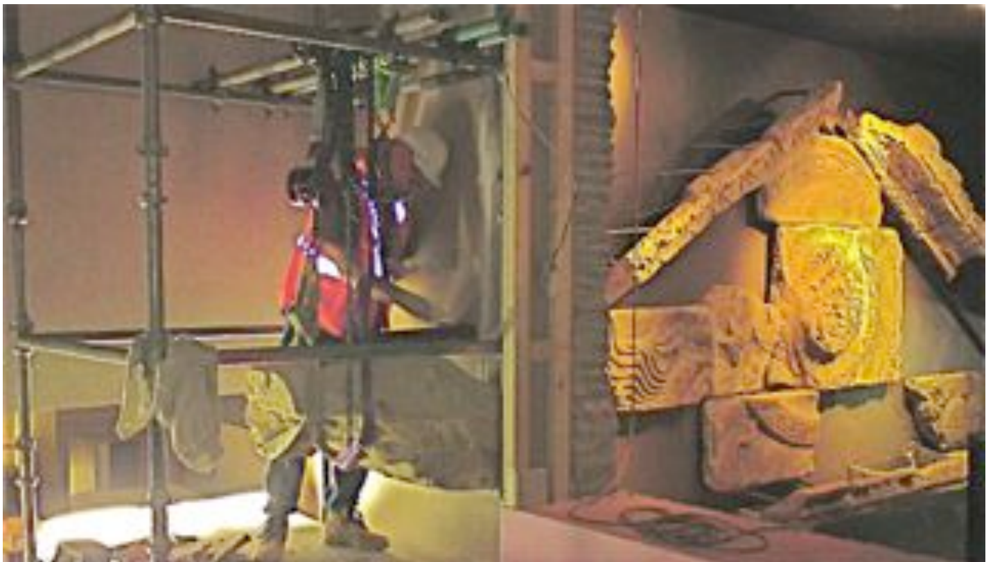
Fixing fragment of cornice, below (previously undisplayed).

We are currently working at the Roman Baths in er...Bath. We are conserving and re-arranging many Roman stone artefacts within the galleries (including re-fixing and conserving the famous 'Gorgon Pediment' left ). It's a bit of a career highlight to be caring for the objects that inspired our name and logo.