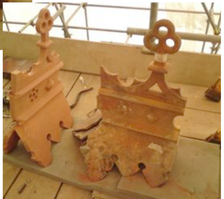
And after repair and conservation.